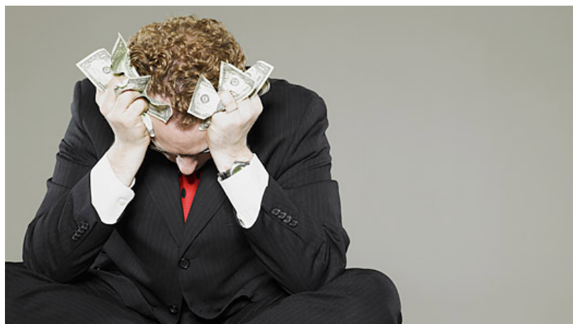
Baerbel Schmidt / Getty