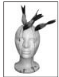
Elisabeth Bersin used pinwheels, broken glass, pecking birds, paint, newspaper, and other media to create a tangible, viewable representation of inner pain.