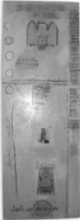
Stacie Krajchir incorporated boyfriend Phineas Cabrera's suicide note into this 6' x 2' oil painting, "Lost & Found."